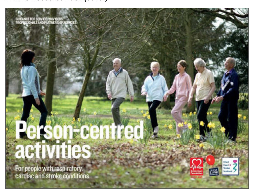
Figure 2 PARCS Resource Pack (cover)